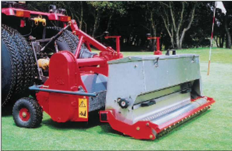
Overseeder CR 140 on golf greens