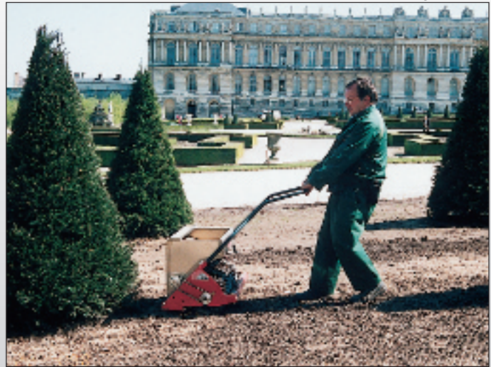
Seeding of small areas with the Seedy