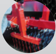
Coil tine track remover kit