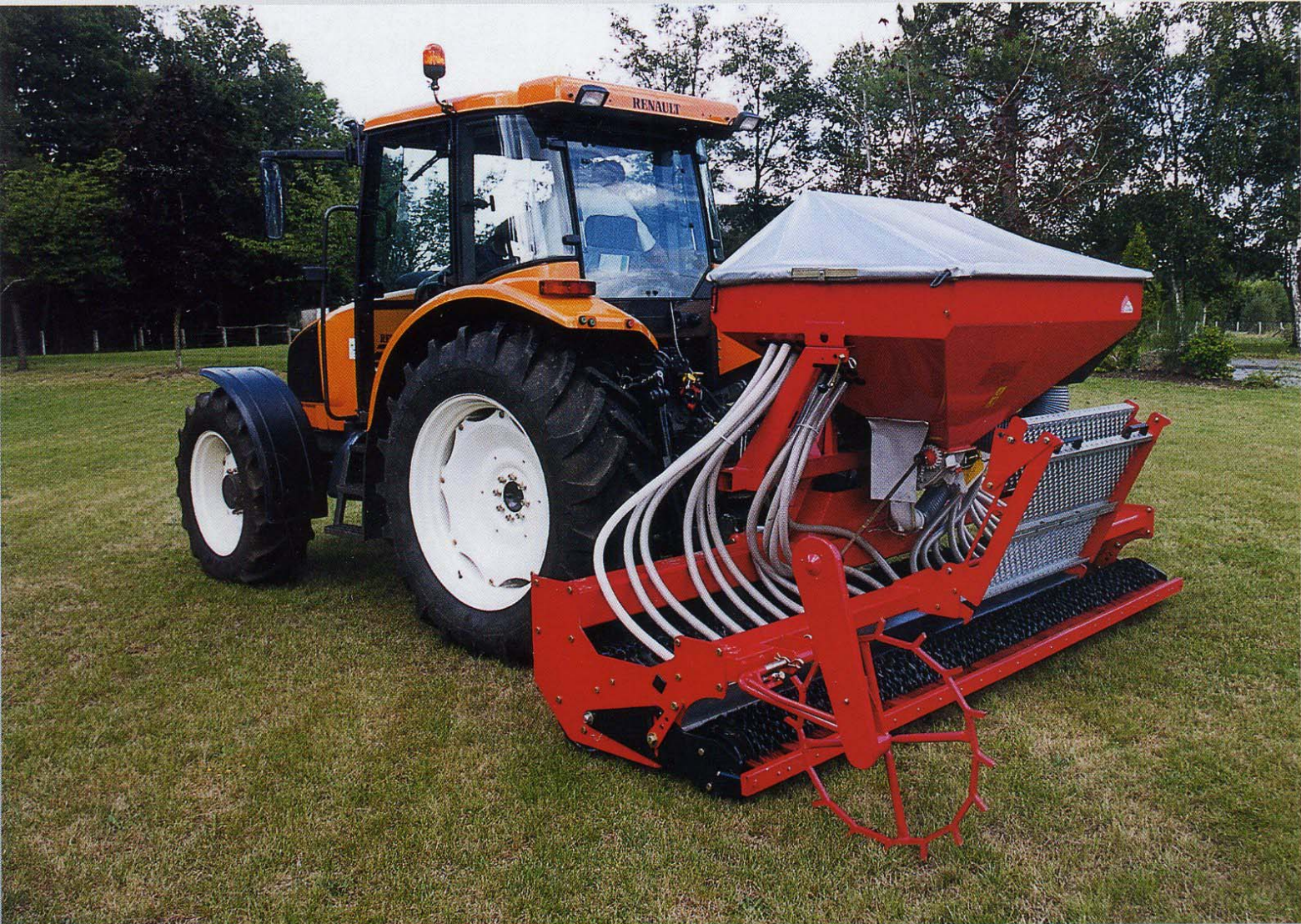
SMA 305 Primary Pneumatic Seeder notched rollers