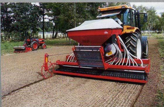
PRIMARY Pneumatic SEEDER