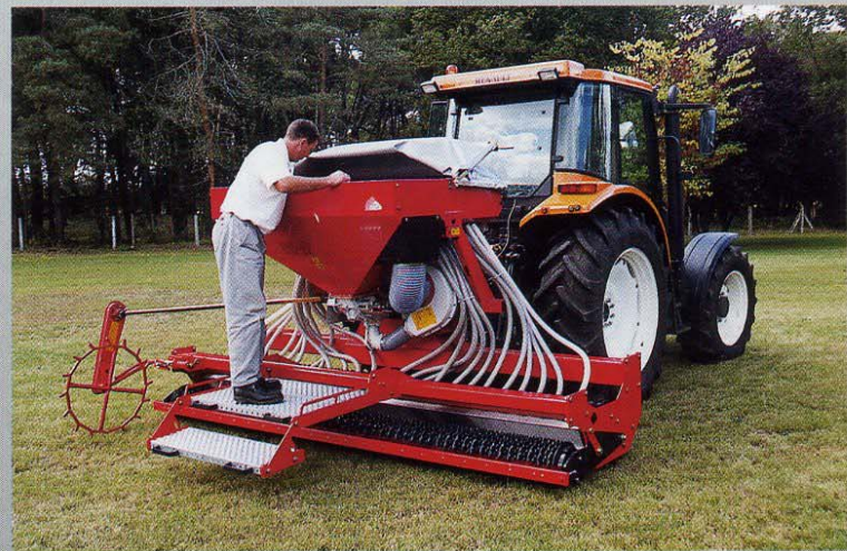
Platform on SMA 305 & 405 Primary Seeder for easy loading Floating rear roller ensuring consistent seed/soil contact