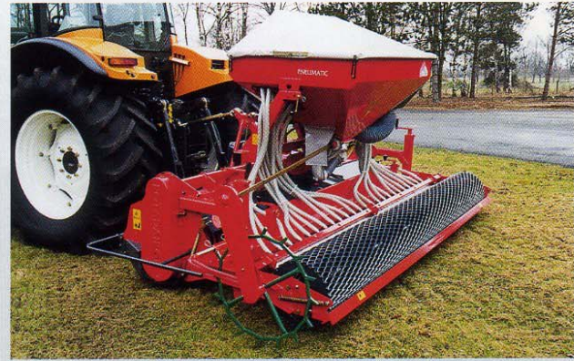
RotaDairon RX 220/250/300/400 Soil Renovator+ SMA Pneumatic seeder = Combi-Seeder RotaDairon RMA