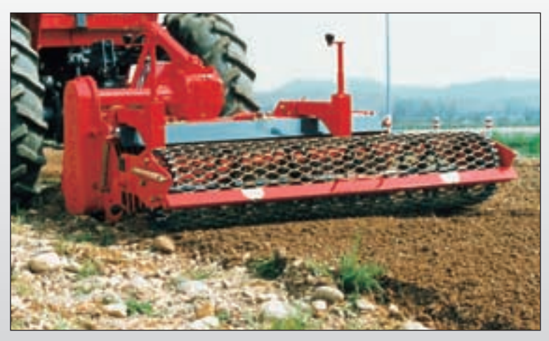
RD 150: buries stones effectively