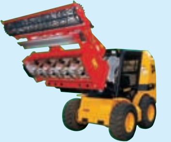
*Weight with mesh roller & without Seed-Box