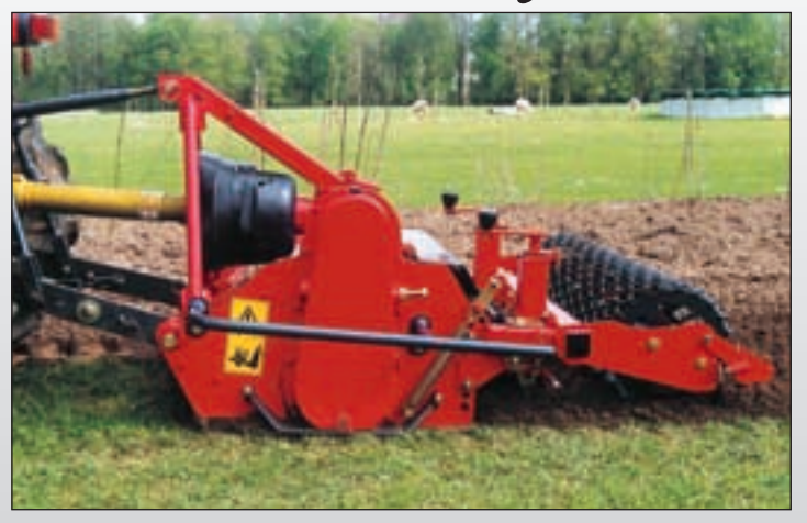
Stony: the Compact Soil Renovator™ for tractors from 12 to 20 HP