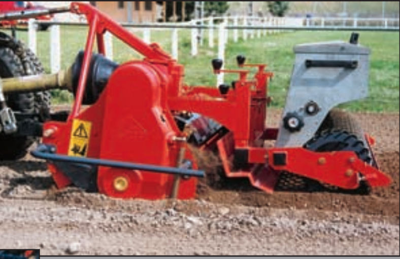
RM 130 combi-seeder on small site (RD 130 + SM 130).

For tackling the toughest jobs: burying of larger stones and debris with a greater working depth, and leaving a blended soil surface.