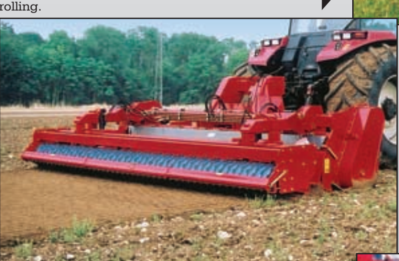
RXX 400 Super heavy duty Soil Renovator<sup>TM</sup> for large areas : golf courses construction, sod farms, pastures renovation...

Performs the following operations in a single pass: soil cutting, burying of stones - debris grass and weeds, fine surface preparation and rolling.