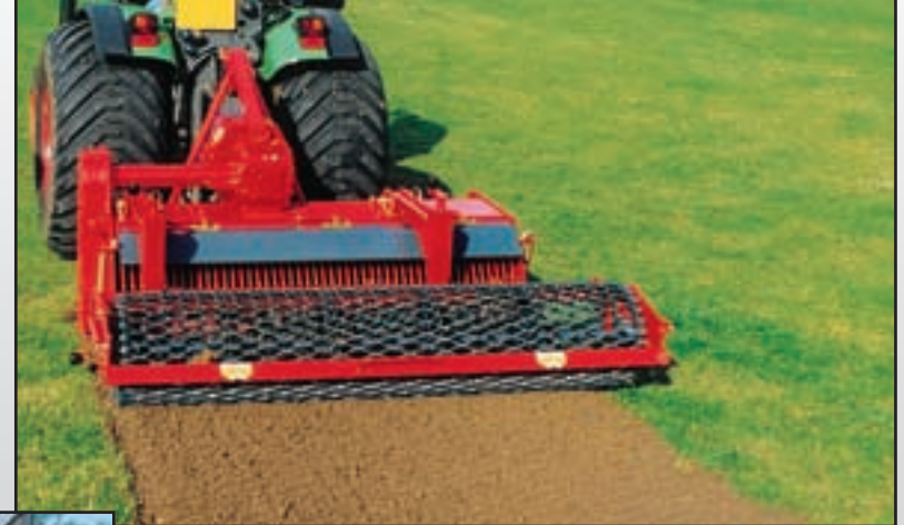
Direct operation with the RD 150 compact Soil Renovator™.