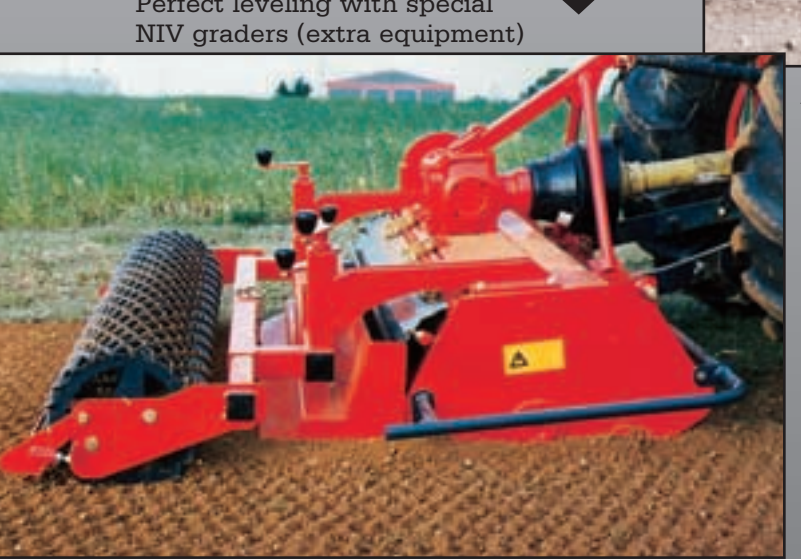
RD 130 with NIV special grader blade.